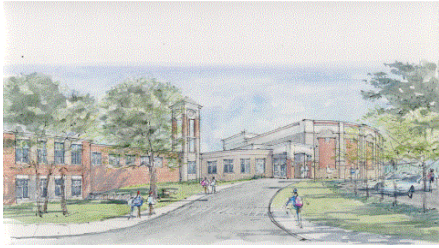
Milton High School