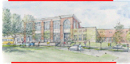
Pierce Middle School

Total area: 13.28 square miles Population: 25,855 (2004) Households: 9,800 (2004) Population per Square Mile: 1,999