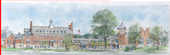
Cunningham School & Collicot School