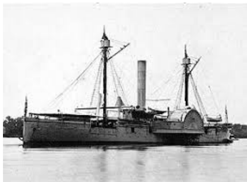
Left: USS Agawam

An awards ceremony is held each year to celebrate the winning students' accomplishments. This year, the ceremony will be held at the Forbes House Museum, 215 Adams Street, Milton.