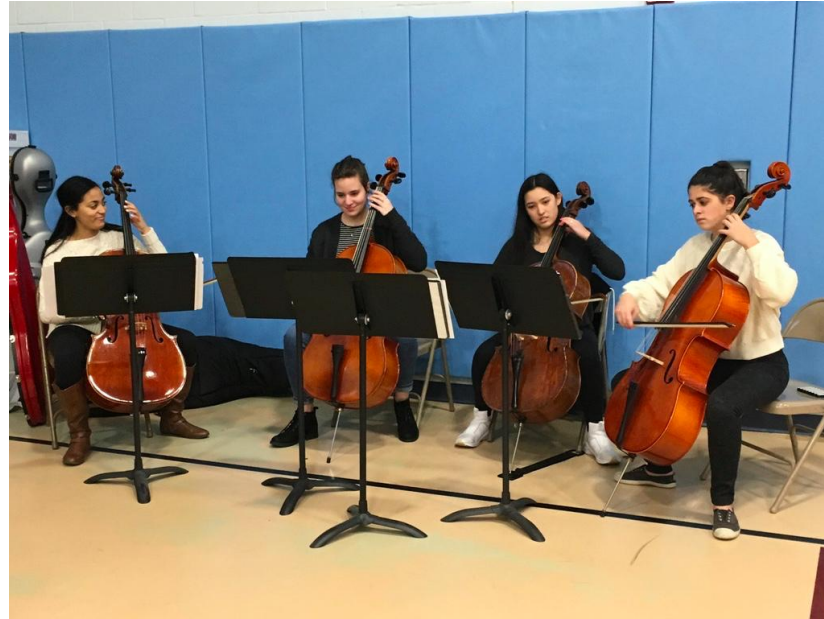
High School String Ensemble