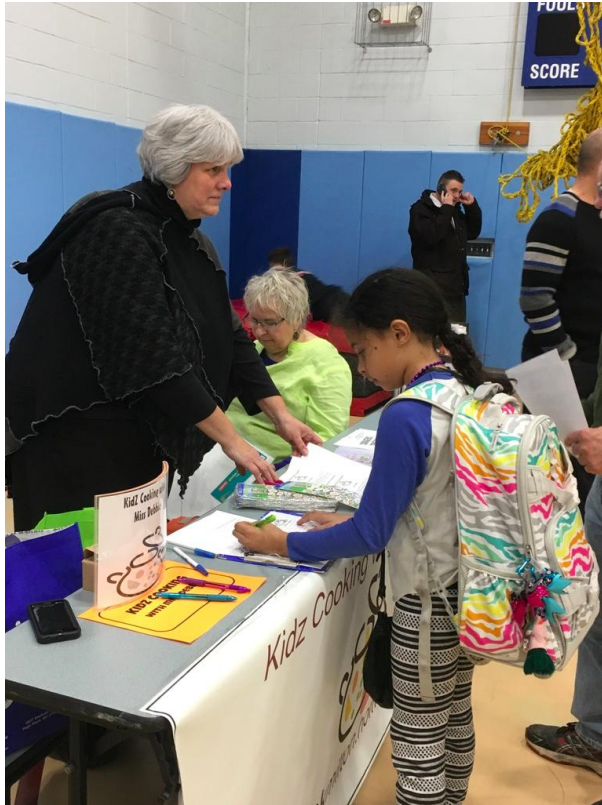
Students signing up for activities