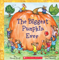
The Biggest Pumpkin Ever by Steven Kroll