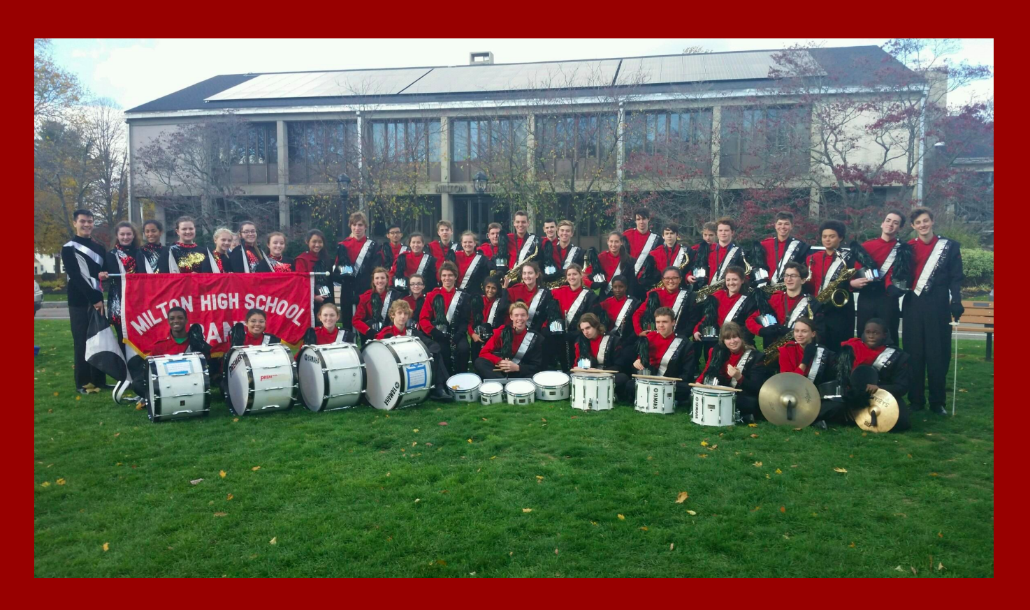
MHS Wildcat Marching Band - Veterans Day Observance Ceremony