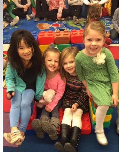
Making New Friends