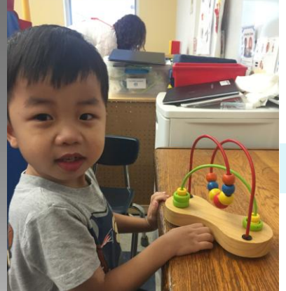
Play and Exploration