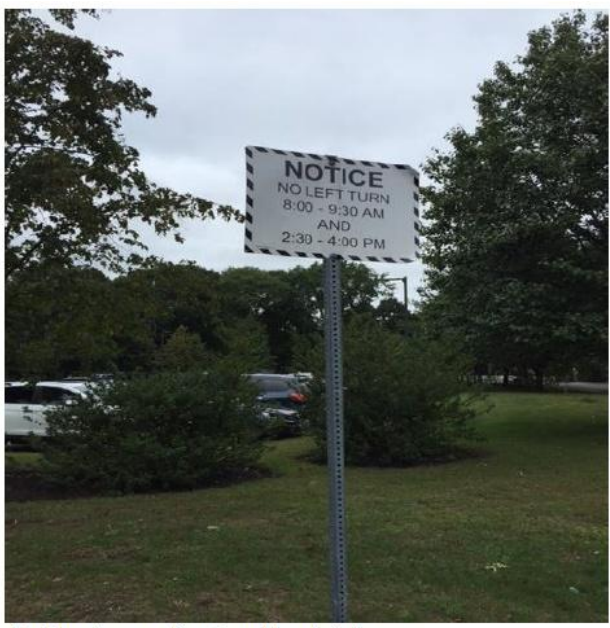
Canton Avenue front parking lot signage.

Please do not take a left turn out of the parking lot after exiting the car line. This impacts our ability to move traffic efficiently. There is a sign indicating NO LEFT TURN and cones are in the road to remind you.