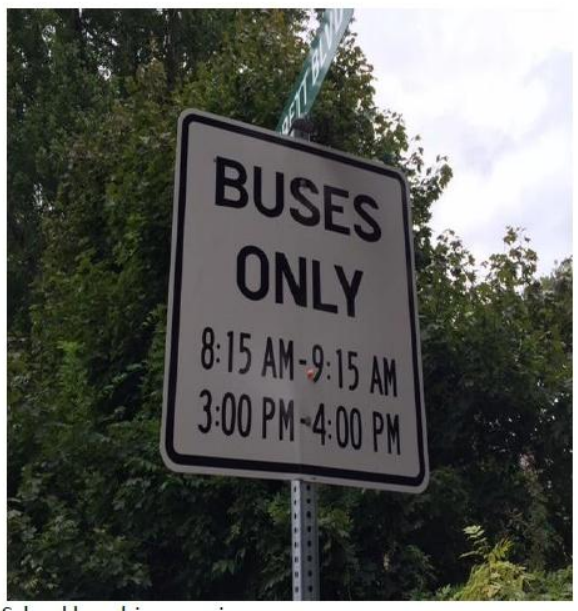
School bus driveway signage.