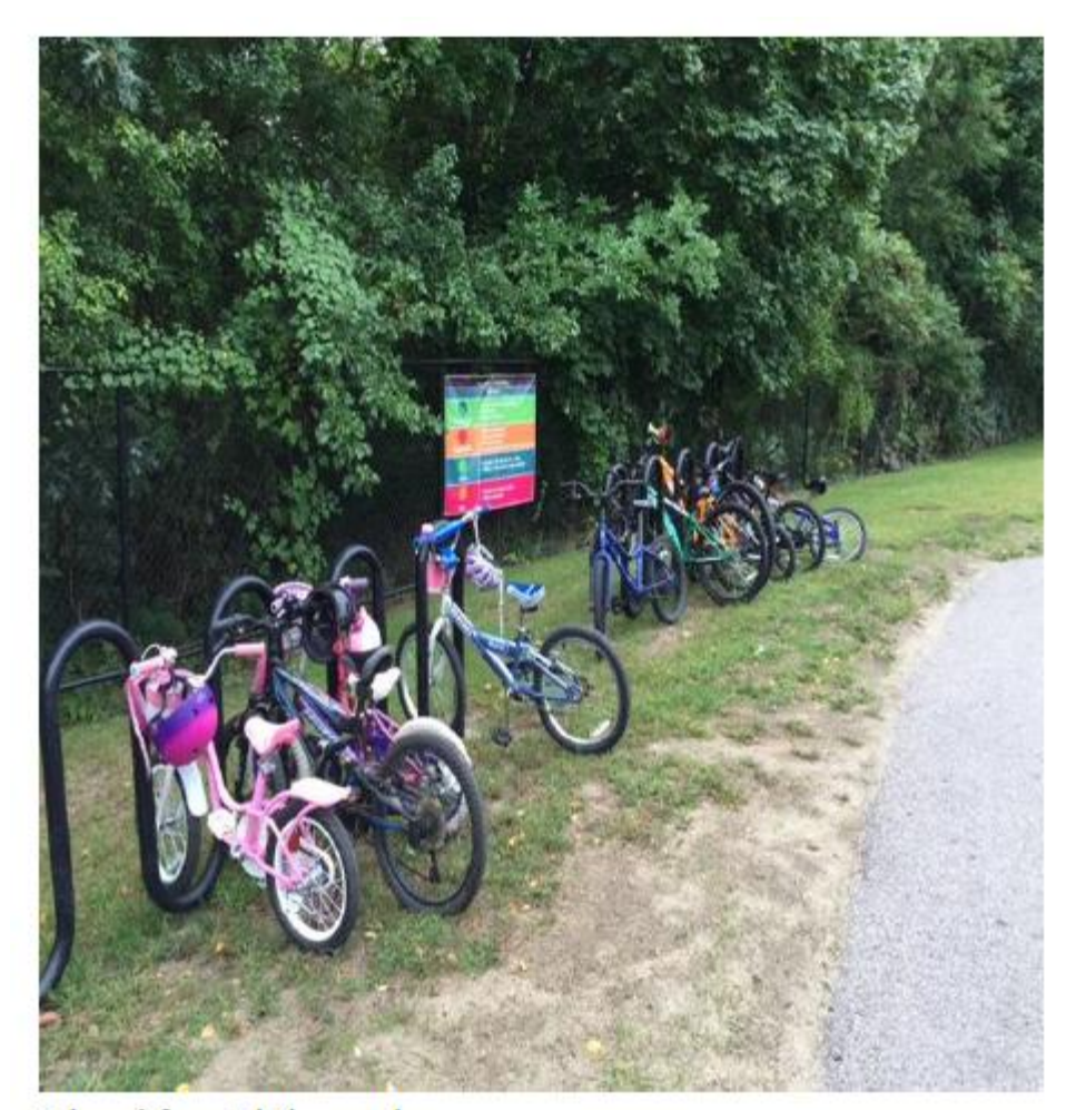
School front bike racks.

Just a reminder...a great way to avoid the car line is to encourage walking or biking to/from school. The school bus is also a wonderful option! To learn more about riding the school bus, go to <a href="https://www.miltonps.org/departments/transportation-department">https://www.miltonps.org/departments/transportation-department</a> or email <a href="mailtonps.org">bus@miltonps.org</a>.