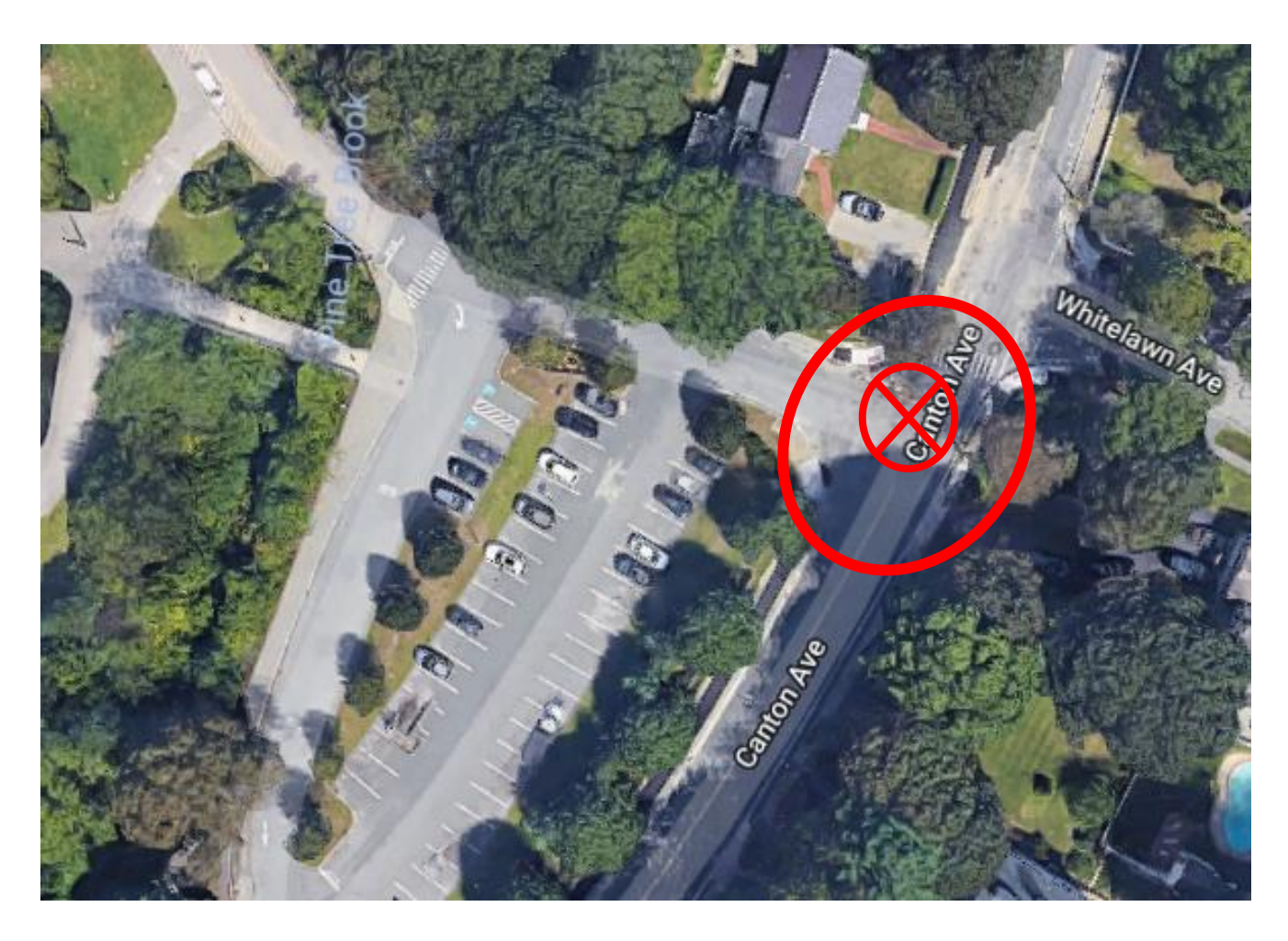
During the hours of 8:15-9:15am and 3:00-4:00pm, this entrance is for BUSES ONLY. Please do not enter through this entrance. Instead, follow the traffic pattern delineated above.