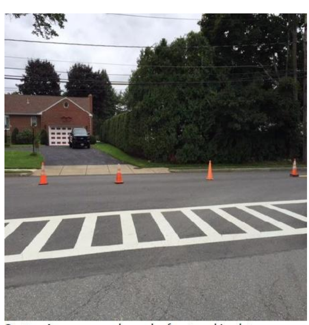
Canton Avenue coned area by front parking lot.