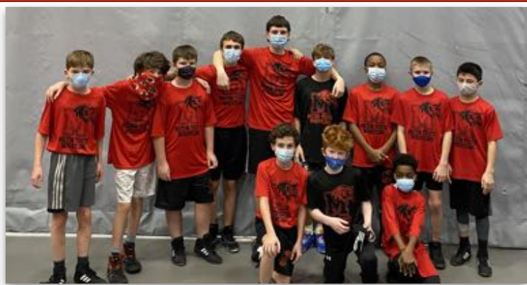
The Pierce Middle School Wrestling scrimmaged with Needham on January 5. The team did great and was very competitive in their 1st scrimmage.